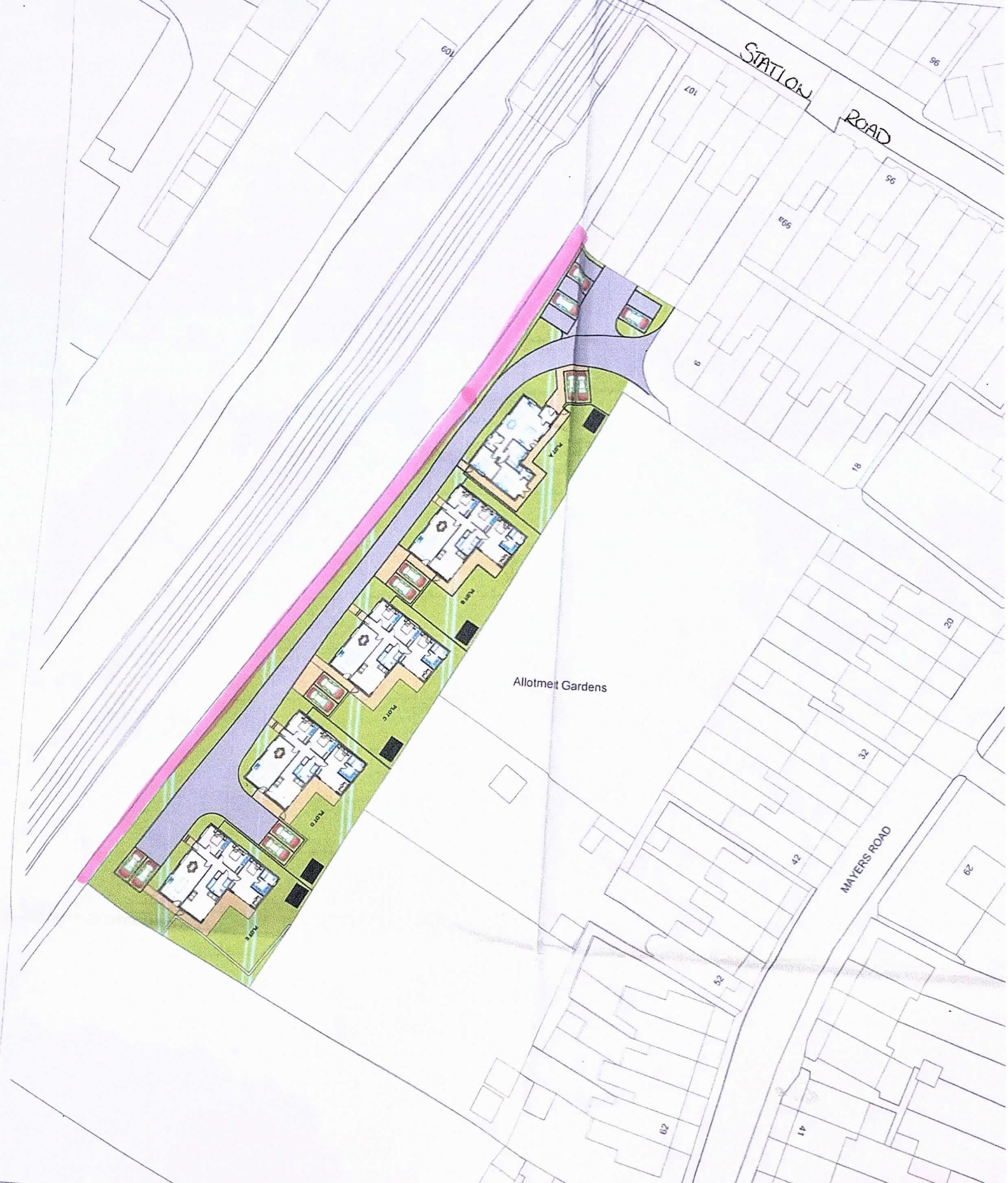
PROPOSED SITE BLOCK PLAN - SCALE 1/500